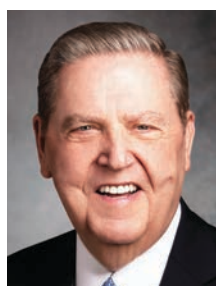
Jeffrey R. Holland