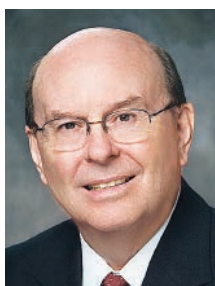
Quentin L. Cook