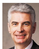
Gérald Caussé Presiding Bishop