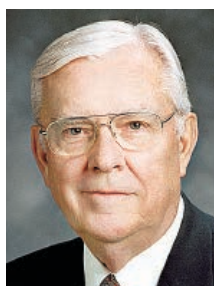
M. Russell Ballard