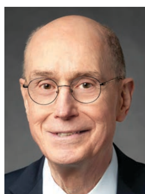
Henry B. Eyring Second Counselor