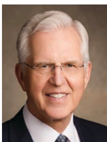
D. Todd Christofferson