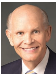
Dale G. Renlund