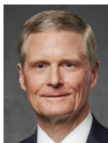
David A. Bednar