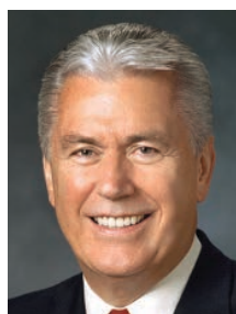
Dieter F. Uchtdorf