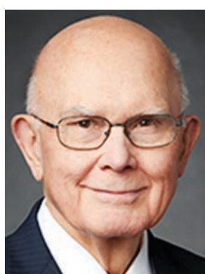
Dallin H. Oaks First Counselor